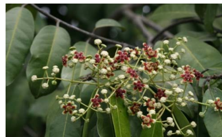
Lophopetalum wightianum Arn.