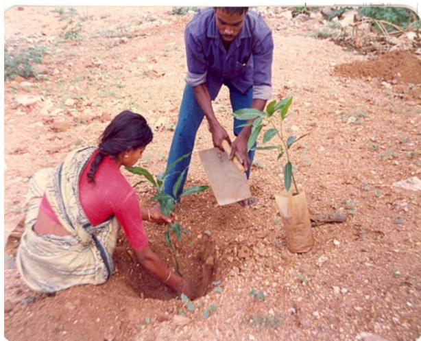
Figure 1: Picture showing the type of terrain on which the miniforest was raised

chosen for planting tree saplings from the forests of the Western Ghats that came to be known as the miniforest. Saplings (480 no's.) belonging to forty nine species (Table-1) which were raised at the CES Field Station Nursery at Sirsi, Uttara Kannada district were obtained and planted along with few species already existing on the plot with a spacing of 3 x 3 m.