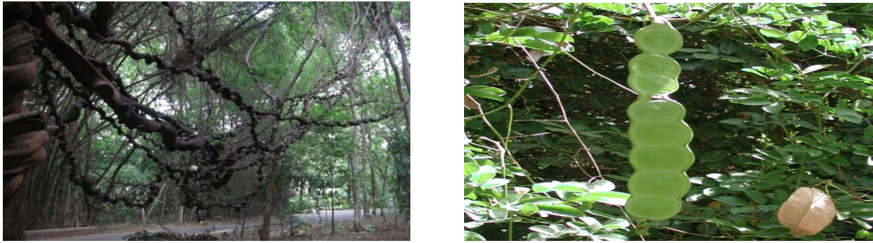
Figure 3: A gigantic liana Entada rheedei Spreng. (with fruits)

in the range of 60-70 m depth before creating the miniforest. Present monitoring of water table has showed that the level of water is at about 3 to 3.5 m below the ground. This indicates that land cover dynamics play a decisive role in recharging the groundwater sources. Four families of Slender Loris ( Loris tardigradus ) inhabiting here is an indication of total wilderness prevailing in the miniforest, further confirming the ecological richness of the habitat.