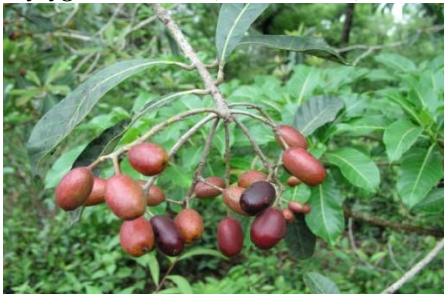
Holigarna arnottiana Hook. f. (Fruiting)