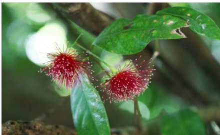
Syzygium laetum (Buch.-Ham.) Gandhi