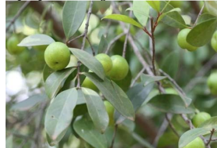
Garcinia indica (Thouars) Choisy (Fruiting)