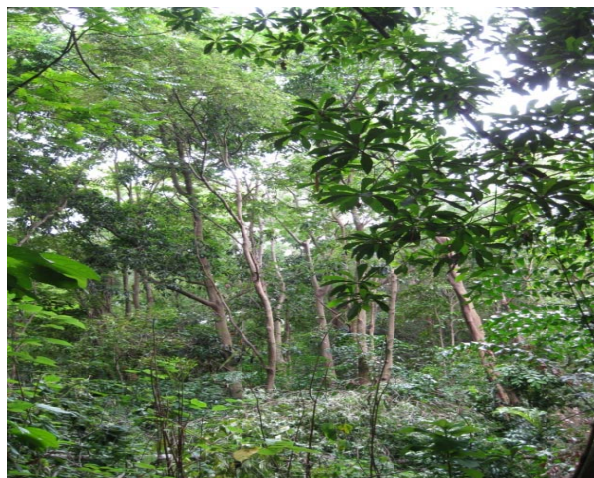
Figure 2: A view of Miniforest

wightianum Arn. and Syzygium laetum (Buch.-Ham.) Gandhi (Fig.-3) have grown as well as they would do in the evergreen forests.