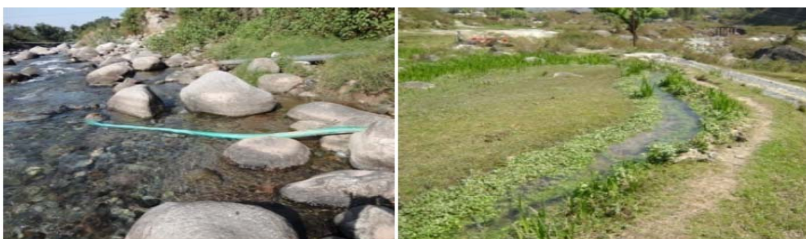
Fig. 2c Photograph showing water withdrawal by IPH & Kuhl (Local water channel)