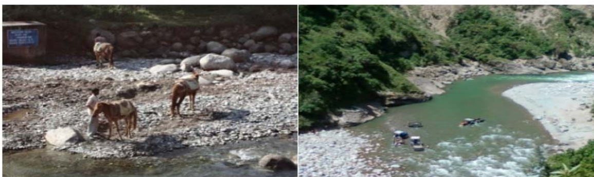
Fig 2b Photograph showing river bed mining

of debris in river generated by power projects add sediment to the river channel thereby affecting the water quality and the fauna.