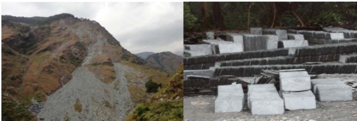
Fig 2a Photograph showing slate mine and godown at Khaniyara

In 1995, a public interest litigation (PIL) was filed by Mrs. Trisha Sharma against the unscientific mining in Khaniyara. The Hon'ble High Court vide its judgment dated 11.12.96 in above PIL allowed the mining activities subject to certain stipulations viz. in conformity with the provisions of various legislations relating to mining activities, prevention and control of Pollution and Forest Conservation Act. As a result the Govt. of Himachal Pradesh vide notification No. Ind-VI (F) 12-40/ 78-1 dated 3-5-97, Shimla-2 has withdrawn the leasing rights from Panchayats and transferred these to Department of Industry (Mines). Based on the study conducted by Central Mining Research Institute (CMRI) with respect to the possibility of scientific mining of slates two areas, one in the catchment of ManuniKhad (16 Hectare) and another in the catchment of ManjhiKhad (9 Hectare) were identified. Till date 9 mining leases have been granted out of which 7 are in the catchment of ManuniKhad in the vicinity of Khaniyara village (Table 1). The production of slate in these quarries was 816 (MT) in 2009-2010 and 616 (MT) in 2010-2011, whereas the royalty collected were Rs. 204000 (2009-2010) and Rs. 153500 (2010-2011) respectively (Source: District Mining Office, District Kangra at Dharmshala, 2011). The debris from the mines invariably finds way to the river thus disturbing the substratum and water quality.