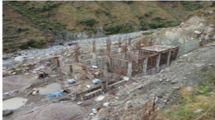
Fig 2d Photograph showing upcoming microhydroelectric project at Khaniyara