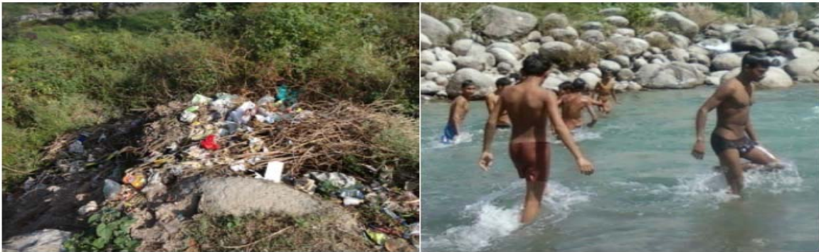
Fig 2e Photograph showing miscellaneous anthropogenic activities

Generally rice and wheat are grown in rotation in these fields. Grazing of goat and sheep by Gaddi (nomadic people) during their six months stay of the year in Kangra valley has also been recorded in riparian zone of River Manuni. Lastly, all adjoining villages use River Manuni as cremation sites for the last rituals of their near and dear ones (Fig. 2d). All these anthropogenic activities have been comprehensively affecting the ecology of River Manuni. The water discharge was visibly reduced in summer as compared to the winter season at all the sampling sites i.e., at S1: 0.67 \pm 0.26 & 0.70 \pm 0.35 \text{ m}^3 \text{ s}^{-1} (SU-I, SU-II) and 0.89 \pm 0.33 & 1.28 \pm 0.65 \text{ m}^3 \text{ s}^{-1} (WI-I & WI-II); at S2: 0.88 \pm 0.53 & 0.47 \pm 0.10 \text{ m}^3 \text{ s}^{-1} (SU-I & SU-II) and 1.59 \pm 0.92 & 2.46 \pm 1.05 \text{ m}^3 \text{ s}^{-1} (WI-I & WI-II) and at S3: 1.66 \pm 0.99 & 0.99 \pm 0.42 \text{ m}^3 \text{ s}^{-1} (SU-I & SU-II) and 3.04 \pm 1.54 & 5.36 \pm 1.34 \text{ m}^3 \text{ s}^{-1} (WI-I & WI-II) respectively. Also, increase in nutrient level was recorded in River Manuni in the downstream.